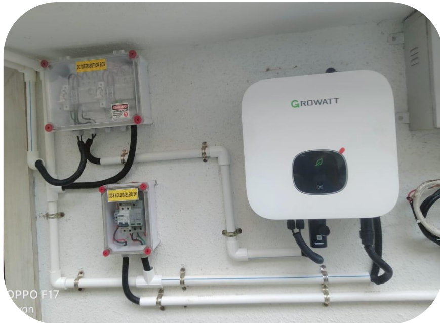
Inverter, ACDB & DCDB