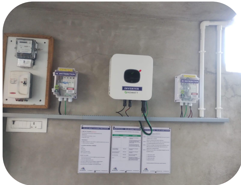
Inverter, ACDB & DCDB