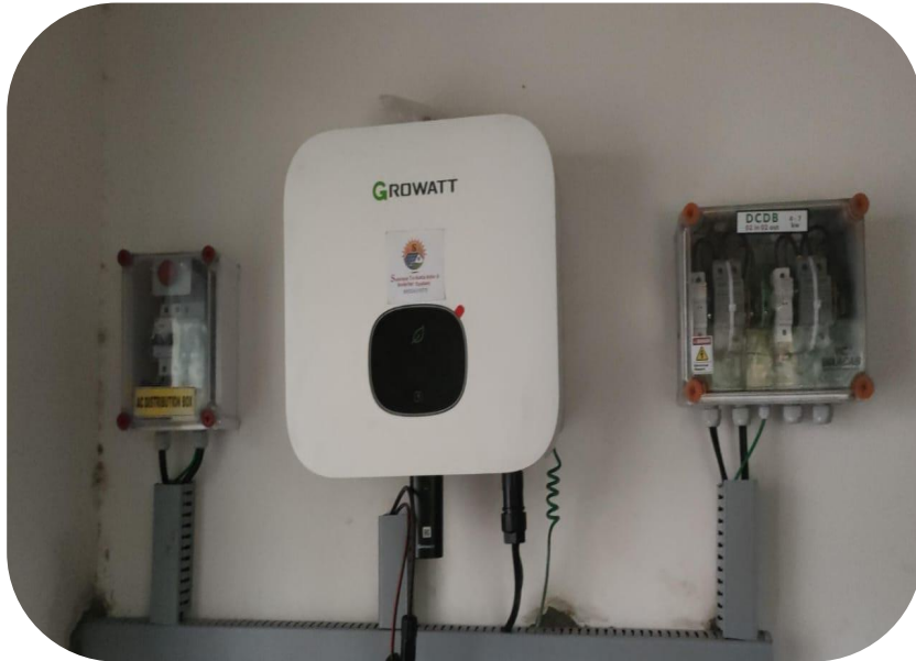
Inverter, ACDB & DCDB